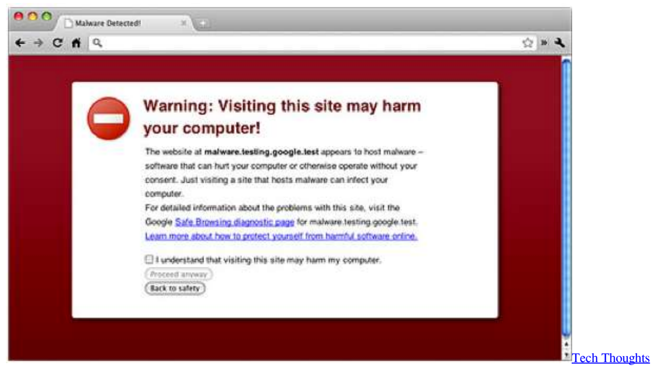
Daily Net News - May 14, 2014

Ransomware attack news trending on Google. ... Highly placed sources say that the school database was hit by the said malware when a member of staff mistakenly opened an email containing ransomware as an attachment. The first news which is trending on Google and related to Ransomware is about Robbinhood malware which can disable all security settings on .... The Google News Initiative is our effort to work with the news industry to help journalism thrive in the digital age. If you're interested in learning how to use Google's .... When a ransomware attack turns your most important files into encrypted gibberish, and ... News. News; The Why Axis \cdot Race to 5G \cdot Readers' Choice \cdot Deals ... Many antivirus vendors, among them Kaspersky, Trend Micro, and Avast, ... on file-syncing services such as OneDrive, Dropbox, Box, and Google Drive. <u>Dueling Blades</u>